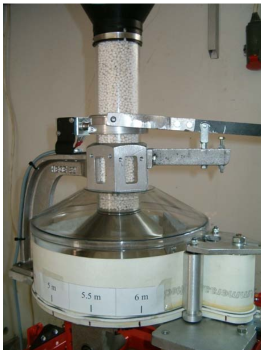
Figure 2: Examination of the Cone-belt Dispenser

A test-bench was set up for the experiments (Figure 2). The work quality can be spoiled, if the axis of the cone dispenser is not vertical. Therefore, work quality examinations were made in case of different inclination angles. The frame of the cone dispenser was adjusted horizontally. The laser angle-gauge (which was on the frame) was adjusted horizontally and was calibrated to the sign of 0^\circ on the wall. The frame of the cone can be adjusted in two directions by two levers of the eccentric wheel. The external part of the belt of the cone dispenser was separated into 12 segments (I tested the appliance by modelling of a 6 m long plot, so one segment was 0.5 meter). A given amount of fertilizer was filled into the supply cylinder, then the cone was turned over and 12 fertilizer samples were taken out. The quantity of fertilizer was measured with four types of fertilizers (the accuracy of the balance was 0.1 g). The adjusted tilt angles of the cone were set as follows: 1^\circ ; 2^\circ ; 3^\circ ; 4^\circ ; 5^\circ . The supplied quantity of fertilizer was 216 g. I tested the appliance by modelling a 6 m long and 1.2 m wide plot.