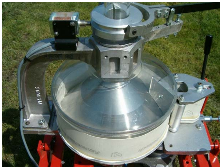
Figure 1: The Cone-belt Dispenser

At the beginning of the plot - when the process starts - the supply cylinder is lifted, and the particles fall down on the surface of the cone. The granule is fed into the supply cylinder and collected on the head of the distribution cone. Finally the granule is driven into the groove, located between the base of the cone and the rubber conveyor belt. The granule is moved by the rubber conveyor belt, driven by the cone. The cone with surrounding rubber belt must make one revolution on the full length of the plot. The speed revolution of the cone can be adjusted by changing the sprockets between the ground wheel and the driven cone. There is a hole on the circle surface of the cone, where the particles discharge from the cone (Figure 1).